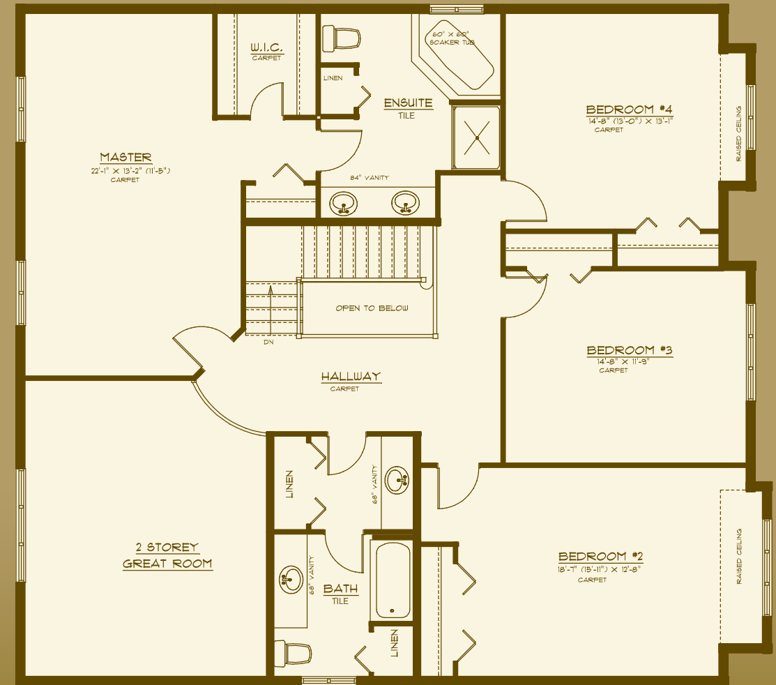
Upper Floor 1,889 Sq. Ft.